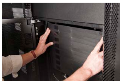
Insert the adjusted panel to fill the remaining open rack space.