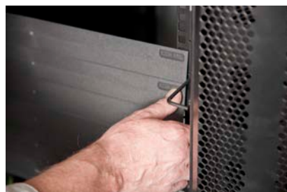
Place the panel in the required position and align the clips with 19" mounting holes