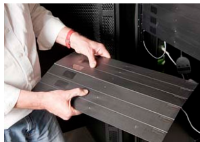
Easy selection of individual panel combinations. Firmly bend along desired position...