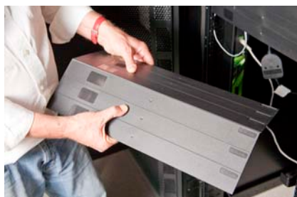
...fold backward and "snap" off as required.