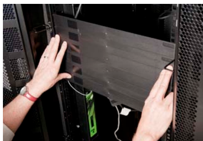
Push the clips firmly into position on each side