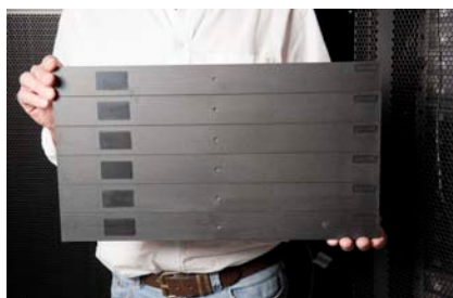
EZIBLANK® Installation, 6 x 1U Panel