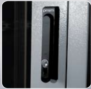
Lever Latch 3 Point Locking