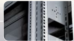
Adjustable 19" Mounting Profiles