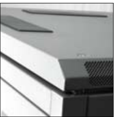
Multiple Roof Access Points

of this cabinet provides multiple cable entry positions and can also be partnered with cold aisle and overhead race way solutions.