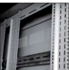
Vendor Neutral Adjustable Mounting Profiles