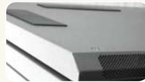
Multiple Access Points