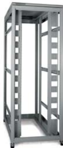
Bolted Steel Frame Chassis With High Load Capacity

A full range of door variants are available, see page 23