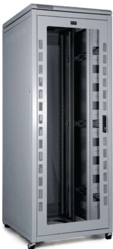
Model shown: CAB39810