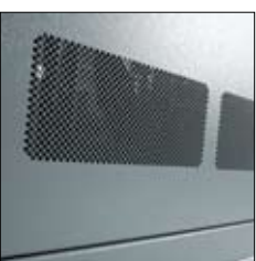
Additional Mesh Inserts To Assist In Heat Dispersion