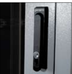
Lever Latch Locking Mechanism